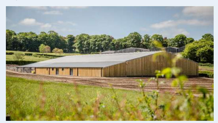
External view of arena