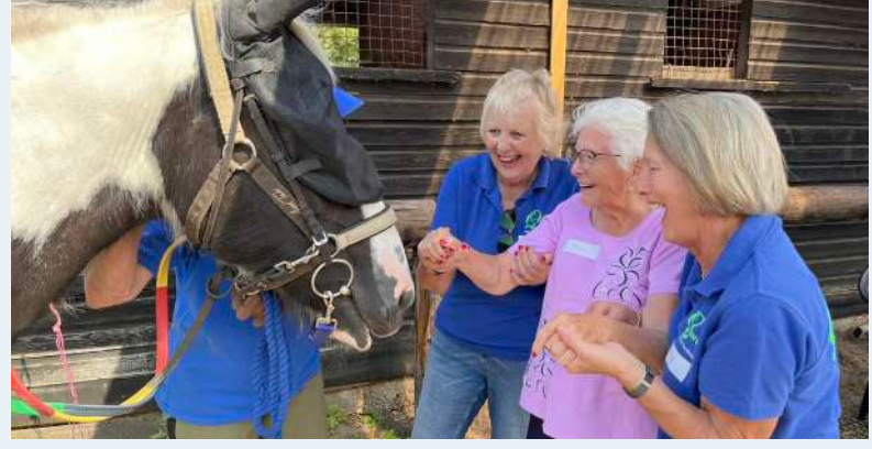
One of Quest's Tea with a Pony guests meets Magic