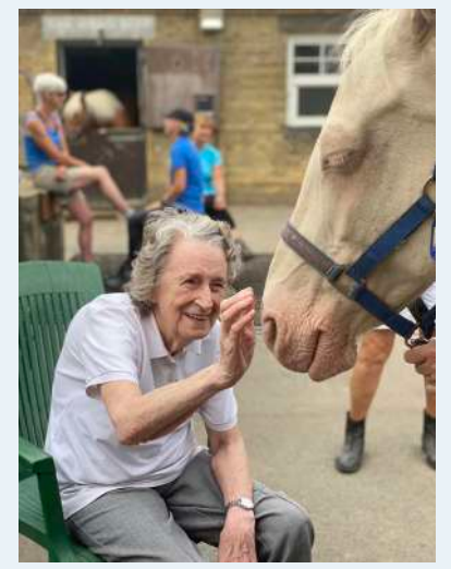
Residents of Linwood care home meet Epsom's pony Briony