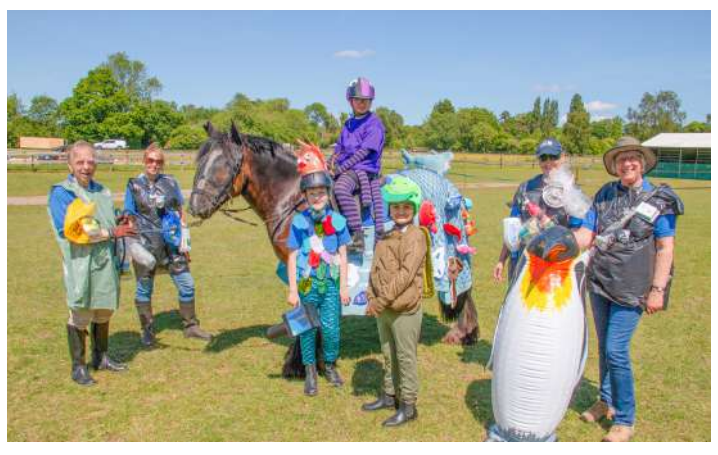
Samber take the Fancy Dress Cup with their Blue Planet entry