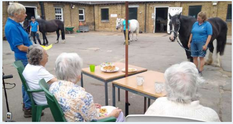
Residents of Linwood care home watched a pony parade at Epsom