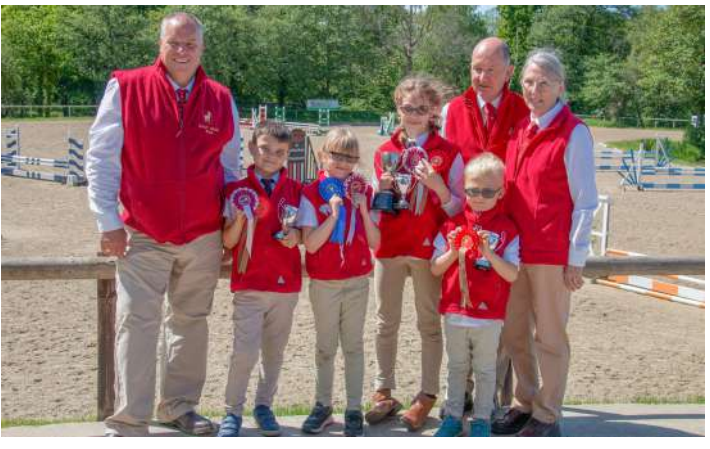
East Park have a very successful day with 3 wins and a 2nd place